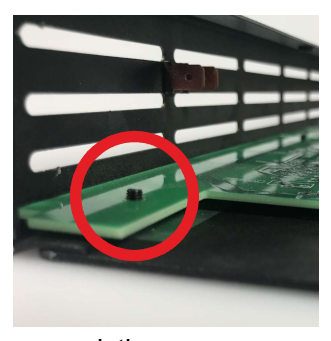
use existing screws to fix the pcb